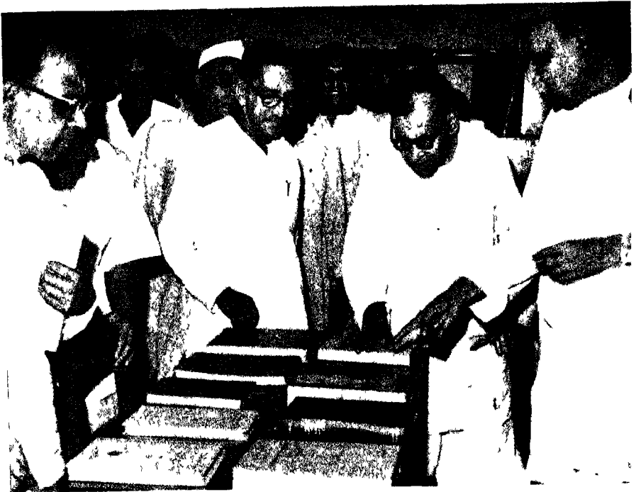
Going round the Book Exhibition